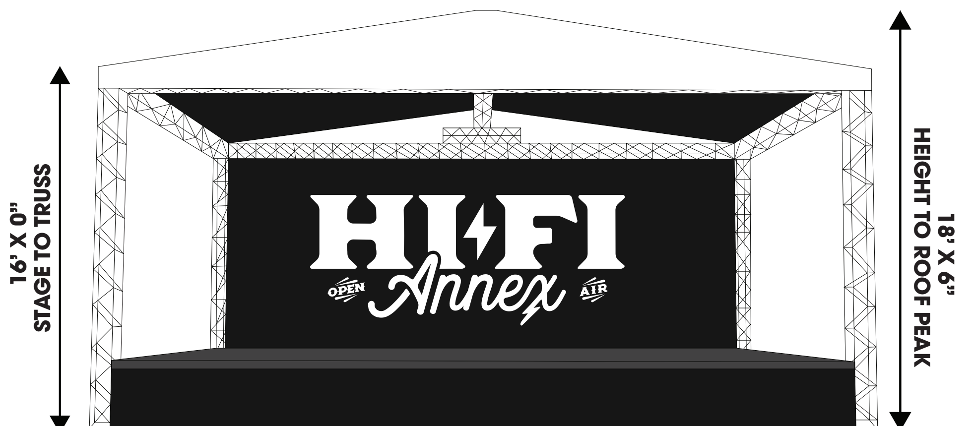
Tent coverings at FOH and SL